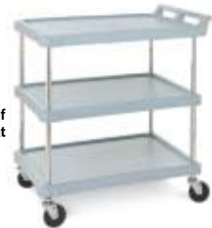
3-Shelf BC Series Flat

Specifications: Utility cart consisting of at least 2 polyethylene, injection-molded shelves containing Microban® antimicrobial product protection, chrome-plated posts or handle. 2-shelf cart may accept an intermediate shelf if necessary. Cart has four 4" (102mm) diameter, resilient rubber swivel stem casters. Cart rated at 150 lbs. (65kg) capacity per shelf, 400 lbs. (180kg) per unit.