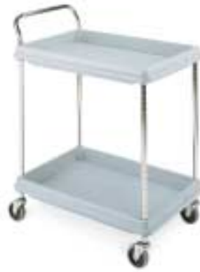
2-Shelf Deep Ledge