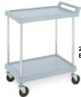
2-Shelf BC Series Flat