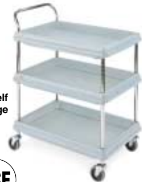
3-Shelf Deep Ledge