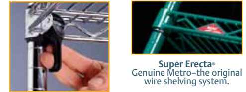
Super Erecta® Genuine Metro—the original wire shelving system.